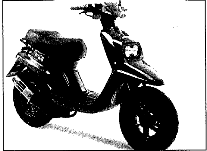
Modèle: MBK Booster Spirit Couleurs: rouge, bleu, noir Prix: 1 600 €